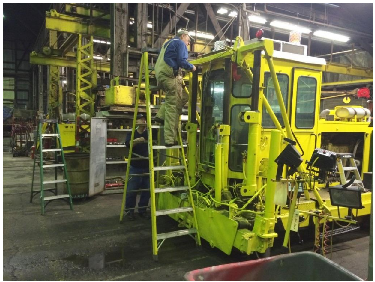
Gene and Cliff installing protective shields over the lights and horn on the new-old tamper