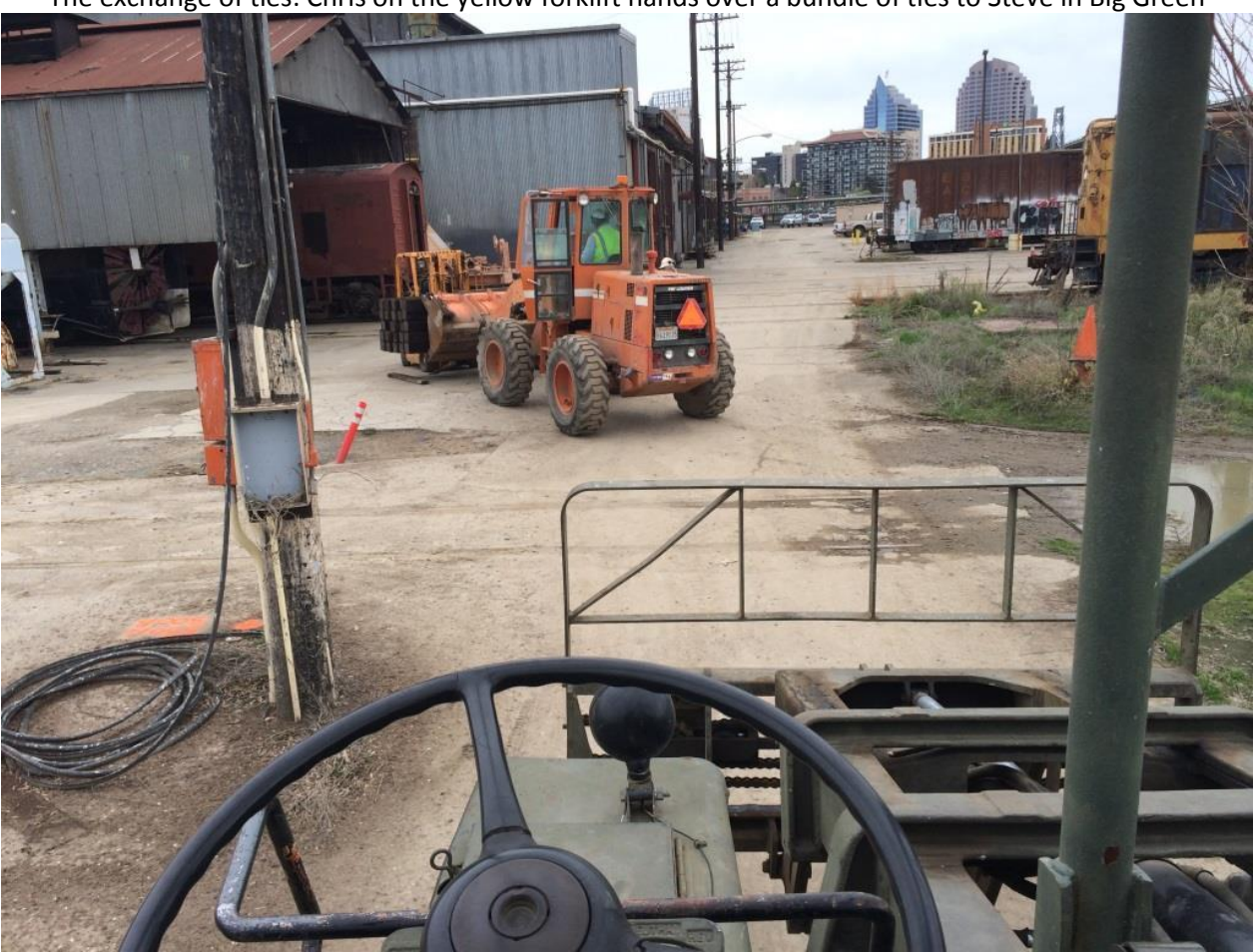
Forklift traffic jam