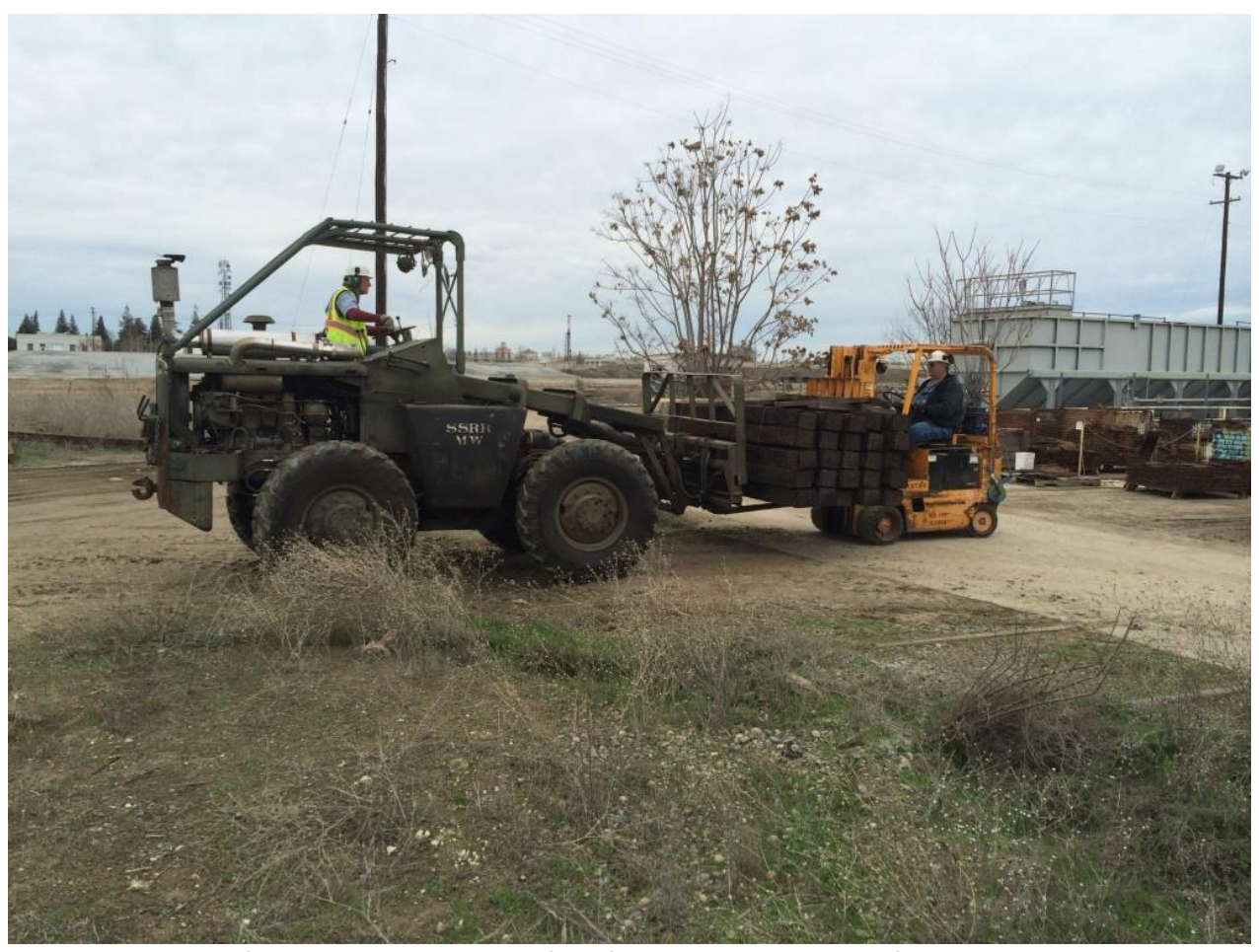
The exchange of ties: Chris on the yellow forklift hands over a bundle of ties to Steve in Big Green